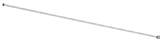
Test Line Termination Kit for Air Stems (TLT-36A)