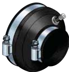
Models TBA-3015, TBA-3020, TBA-4015 and TBA-4020

FlexWorks Test Boots are used to isolate and air-test the interstitial space between the primary and secondary pipe. One test boot is required for each pipe end.