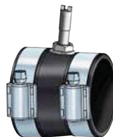
Models TBA-0075, TBA-0100, TBA-0150, TBA-0200 and TBA-0300