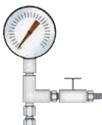
Test Gauge Assembly (TGA-15)