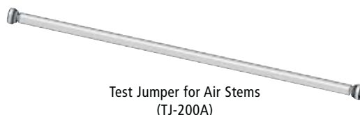
Test Jumper for Air Stems (TJ-200A)