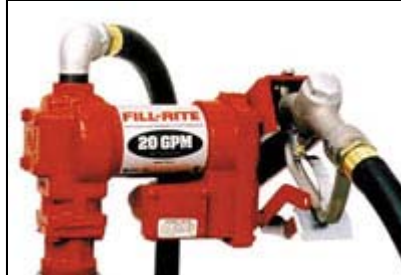
Model 1210C Battery Powered Pump Shown