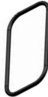
Junction Box Cover Gasket