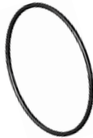
Rotor Cover Gasket