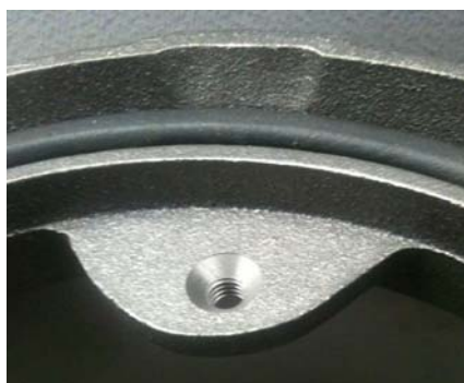
Threaded Countersunk hole detail