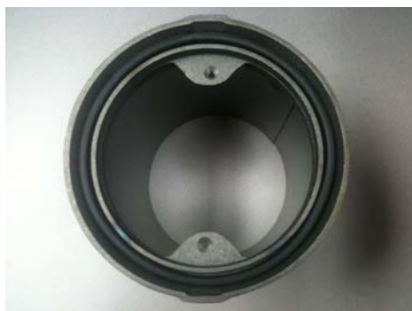
Sealing Gasket - Threaded Ring with countersunk holes