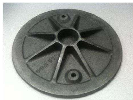
Bottom Lid Detail - Lid Holes do not have threads